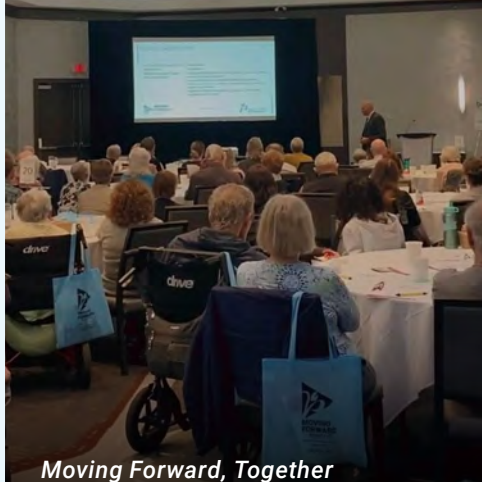
Moving Forward, Together provincial conference in 2022

Referrals from Healthcare Professionals through our PD Connect® Program