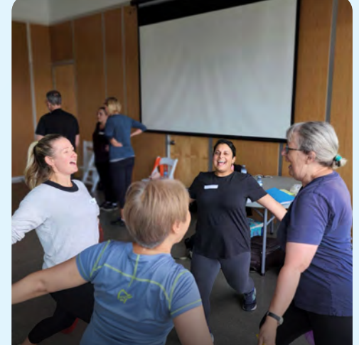
PD Warrior certification training in Vancouver, September 2022

Launched a new healthcare navigation service designed to help the Parkinson's community better navigate the complexities of the healthcare system.